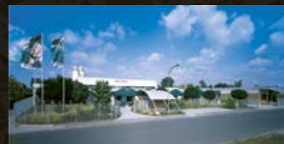
Silikal production and administration in Mainhausen, near Frankfurt/Main, Germany.

Contact us. We would be pleased to go into detail with you – at no cost or obligation to you, of course.