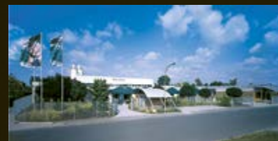
Silikal production and administration in Mainhausen, near Frankfurt/Main, Germany.

Contact us. We would be pleased to go into detail with you – at no cost or obligation to you, of course.